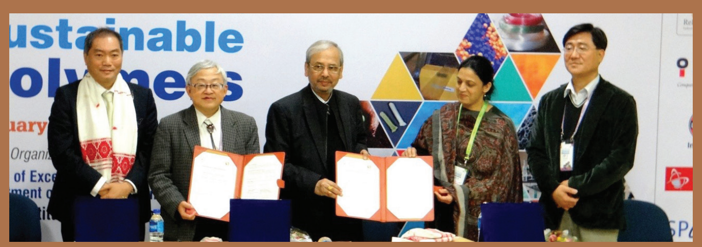
MoU Exchange Ceremony between IIT Guwahati and Ming Chi University of Technology, Taiwan during ASP 17